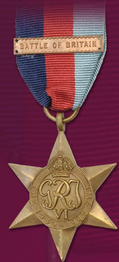
1939 - 1945 Star