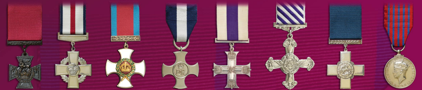
Victoria Cross Conspicuous Gallantry Cross Distinguished Service Order Distinguished Service Cross Military Cross Distinguished Flying Cross George Cross George Medal