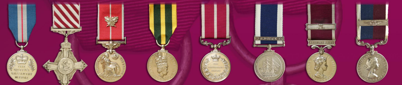
Queen's Gallantry Medal Air Force Cross British Empire Medal (For Gallantry) Queen's Volunteer Reserves Medal Meritorious Service Medal Long Service & Good Conduct Medal (Navy) Long Service & Good Conduct Medal (Army) Long Service & Good Conduct Medal (Royal Air Force)