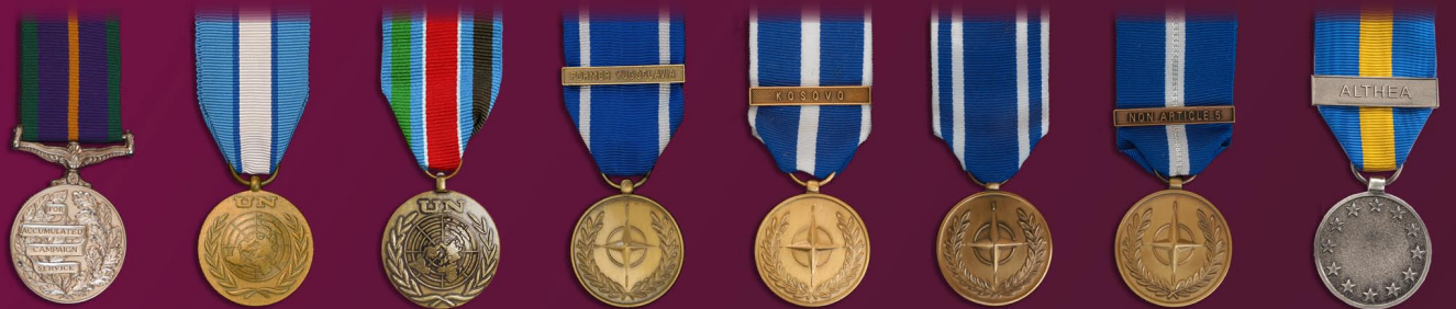
Accumulated Campaign Service Medal United Nations Cyprus Medal United Nations Former Republic of Yugoslavia Medal NATO Former Republic of Yugoslavia Medal NATO Kosovo Medal NATO Macedonia Medal NATO Non Article 5 Medal European Security & Defence Policy Service Medal Op Althea