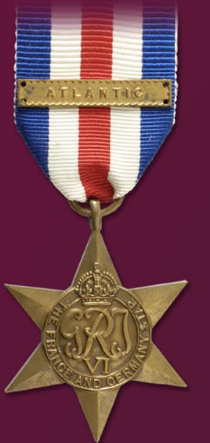
France & Germany Star