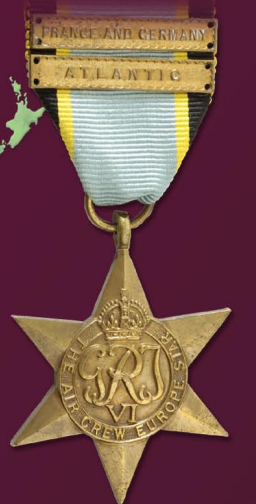
Air Crew Europe Star