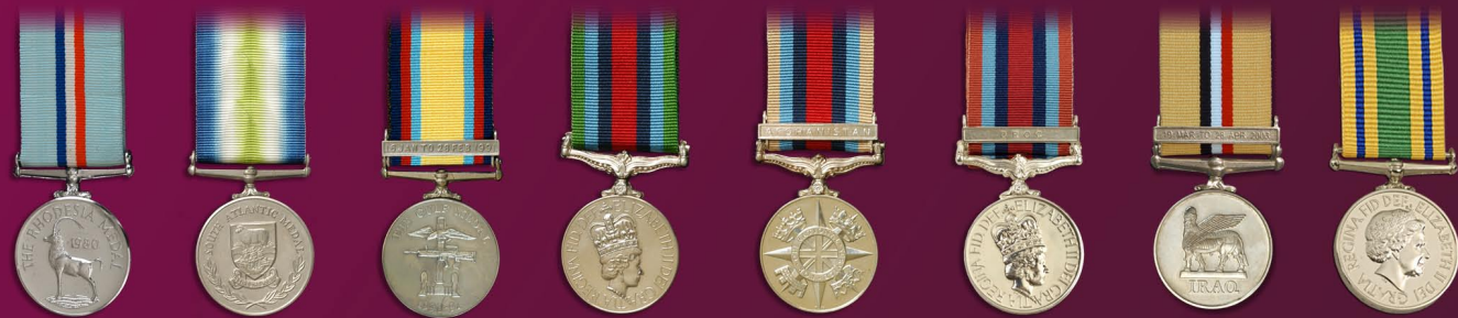
Rhodesia Medal South Atlantic Medal Gulf Medal Operational Service Medal Sierra Leone Operational Service Medal Afghanistan Operational Service Medal Democratic Republic of Congo Iraq Medal Iraq Reconstruction Service Medal