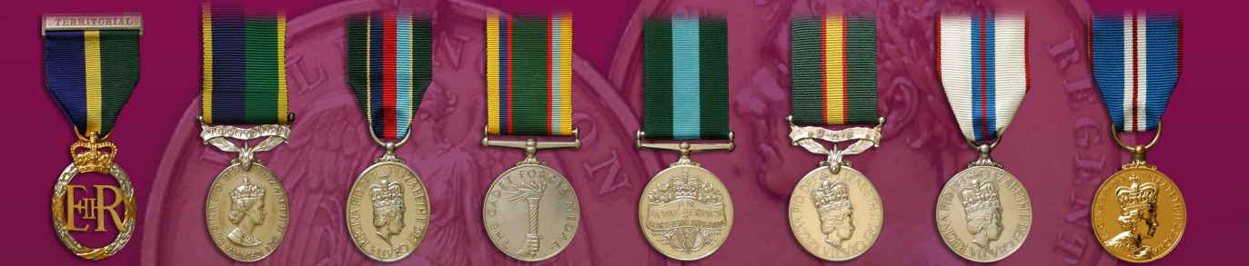
Efficiency Decoration (Territorial) Efficiency Medal (Territorial) Volunteer Reserves Service Medal Cadet Forces Medal Northern Ireland Home Service Medal Ulster Defence Regiment Medal Queen's Silver Jubilee Medal Queen's Golden Jubilee Medal