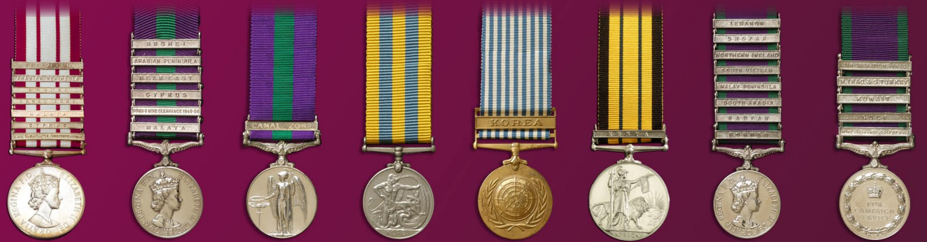
Naval General Service Medal 1915 - 1962 General Service Medal 1918 - 1962 General Service Medal 1918 - 1962 (Canal Zone) Korea Medal Korea United Nations Medal General Service Medal Africa 1952 - 1956 (Kenya) General Service Medal 1962 - General Service Medal 1962 -